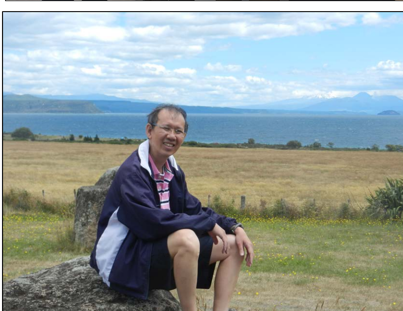
15 Aug 2016 The "boss" is featured in the <u>Straits Times</u>.